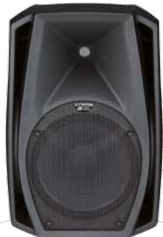
CR 12 club