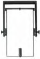
Bracket WB 06