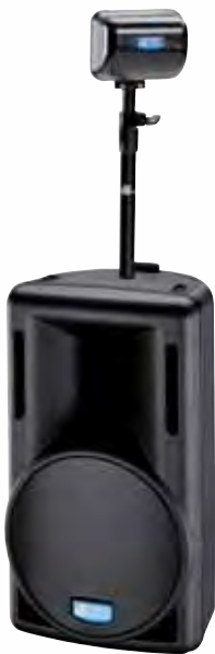
OPERA Mobile with Antenna MS110