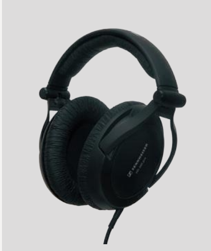
HD 380 pro Monitoring Headphones (foldable)