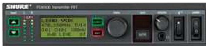
P9T Wireless Transmitter

Operate 20 compatible channels on one frequency band simultaneously with advanced filtering and vastly reduced frequency intermodulation.