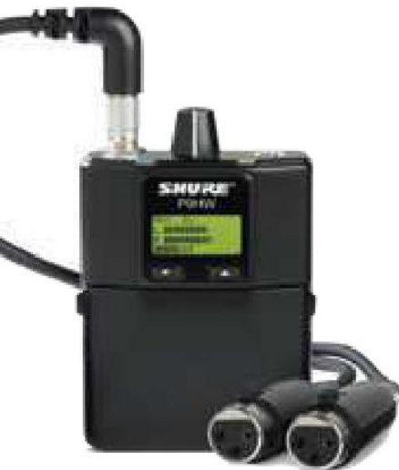
P9HW Wired Bodypack