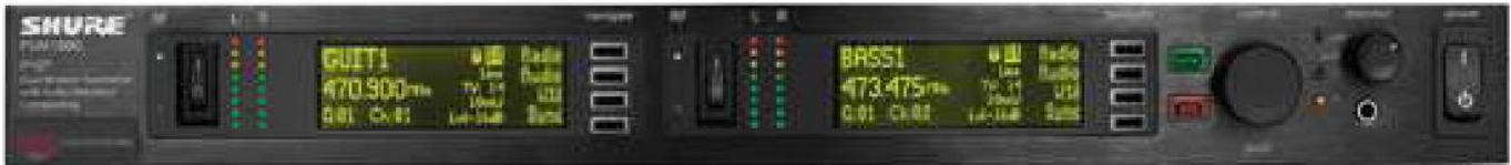
P10T Dual Wireless Transmitter

PSM 1000 is fully networkable with the Shure Wireless Workbench 6 system control software. Work with a friendly interface and more features to manage and monitor wireless performance over the network, from pre-show planning through post-performance analysis.