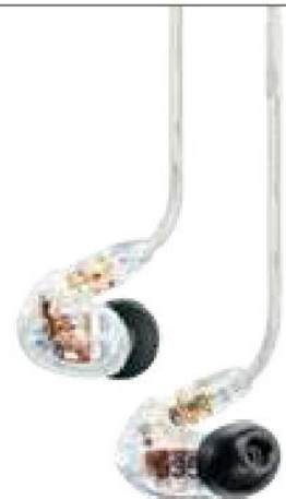
SE535 Sound Isolating™ Earphones Spacious sound + rich bass