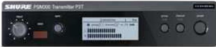
P3T Wireless Transmitter