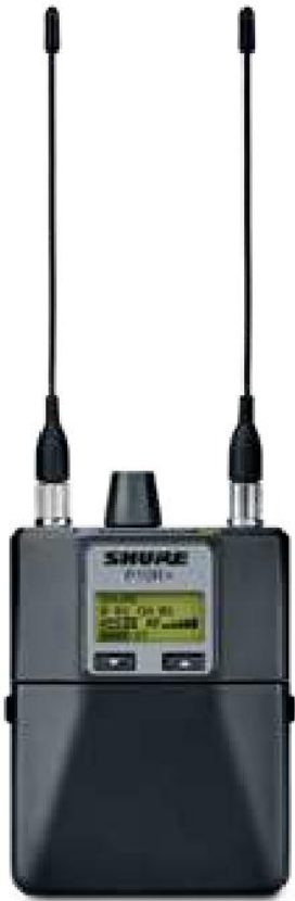
P10R+ Wireless Bodypack Receiver