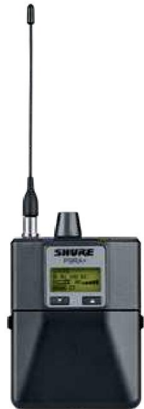
P9RA+ Wireless Bodypack Receiver