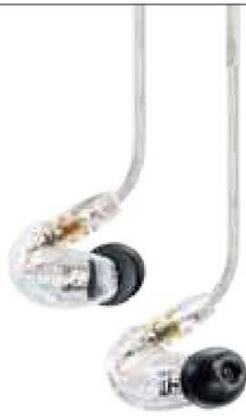
SE215 Sound Isolating™ Earphones Detailed sound + enhanced bass