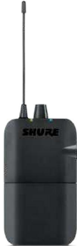
P3R Wireless Bodypack Receiver