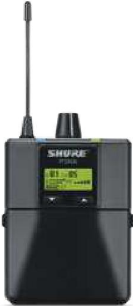
P3RA Premium Wireless Bodypack Receiver