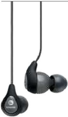
SE112 Sound Isolating™ Earphones Great sound + deep bass

More precise audio. More cable customization. More unique sound signatures. More of everything but background noise. Precision-engineered Sound Isolating™ Earphones come with single, dual, triple, or even quadruple high-definition drivers so you always get the right level of detail in your monitor.