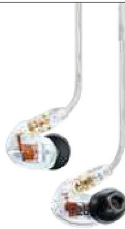
SE425 Sound Isolating™ Earphones Accurate + balanced sound